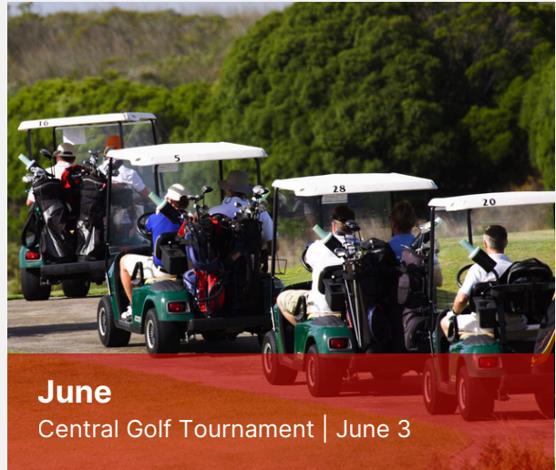
June Central Golf Tournament | June 3