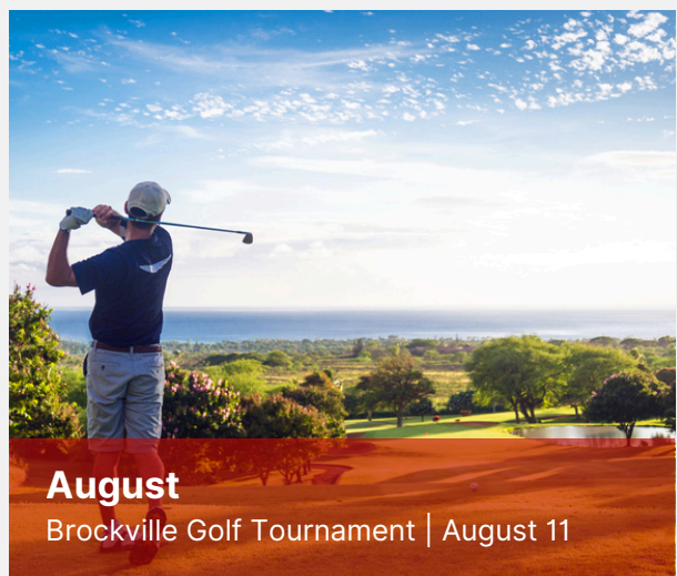
August Brockville Golf Tournament | August 11