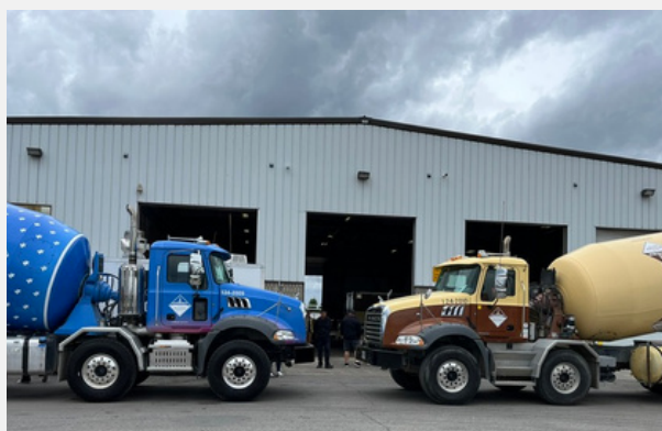
June Truck Rodeo | June 14