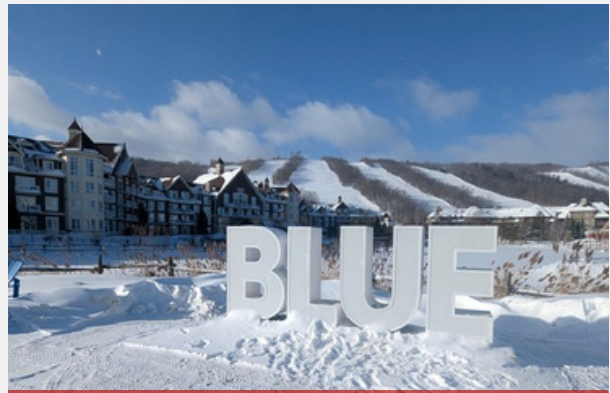
January Annual Ski Day | January 15