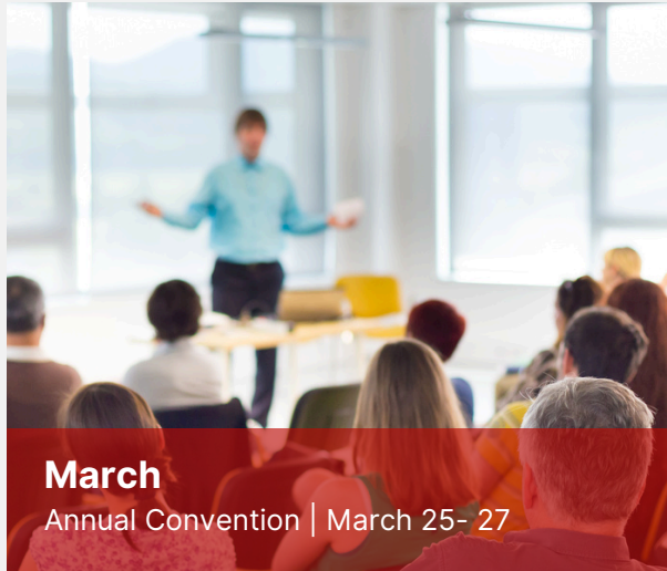
March Annual Convention | March 25- 27